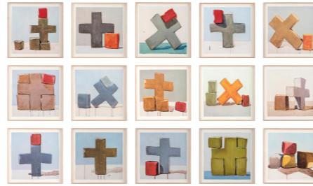
Michel Pérez Pollo Viacrucis , 2023

Individual prints (please contact our office for this option)