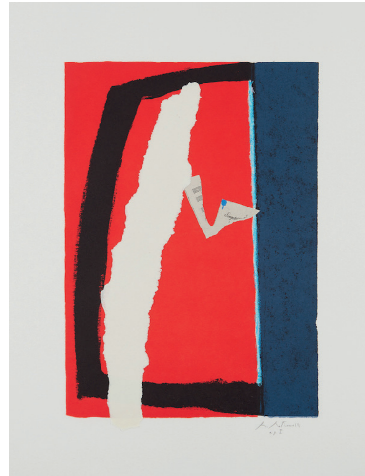
Game of Chance