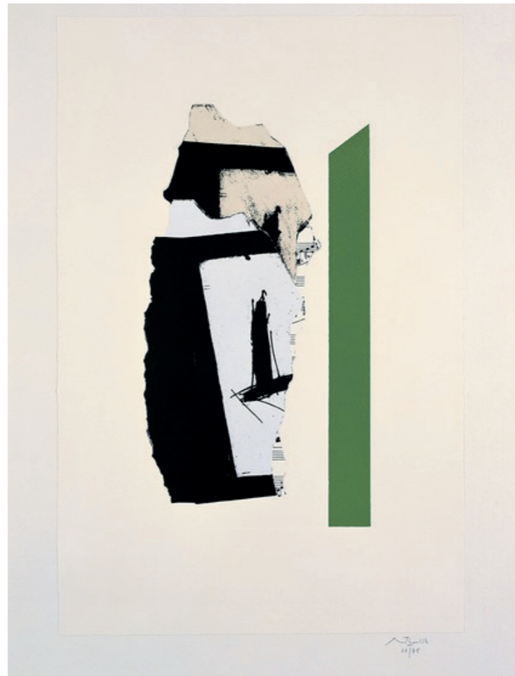
In White with Green Stripe