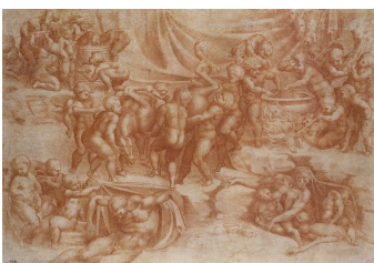
Giulio Clovio , A Bacchanal of Children