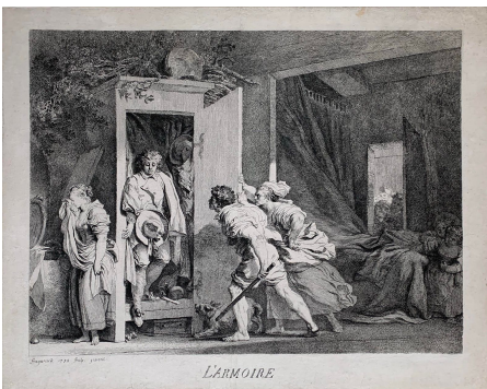
Jean Honore Fragonard, L'Armoire (2nd State)