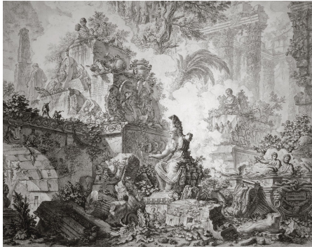
Giovanni Battista Piranesi, Vedute di Roma Frontispiece with Statue of Minerva (3rd State)