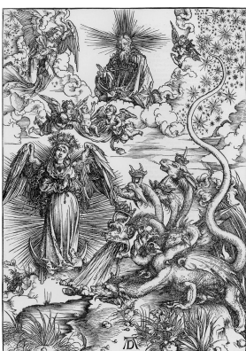
Albrecht Durer , The Apocalyptic Women