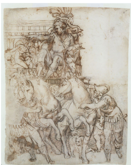
Paolo Farinati , The Triumph of Constantine the Great ,