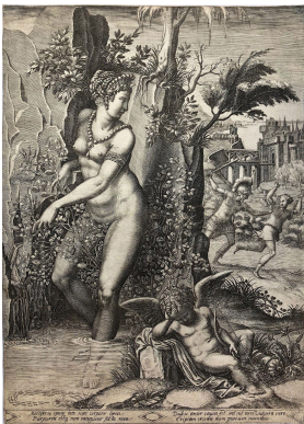
Giorgio Ghisi, Venus and the Rose (2nd State)