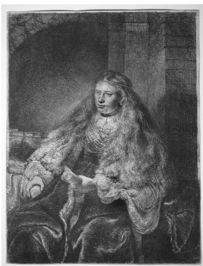
Rembrandt Van Rijn, The Great Jewish Bride