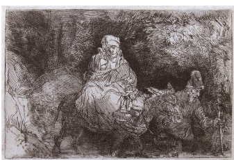
Rembrandt Van Rijn The Flight Into Egypt

Visit rsjohnsonfineart.com for a complete list of artists and available artworks. Contact info@rsjohnsonfineart.com for pricing, further information, and any questions.