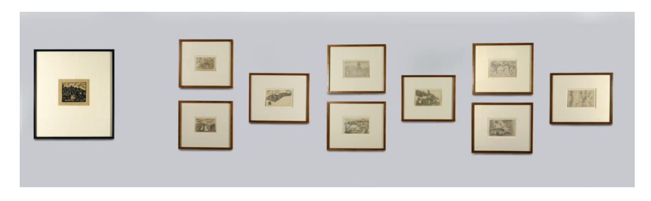
Installation Rendering of 1 Woodcut and 9 Preparatory Drawings for Woodcuts by Lyonel Feininger