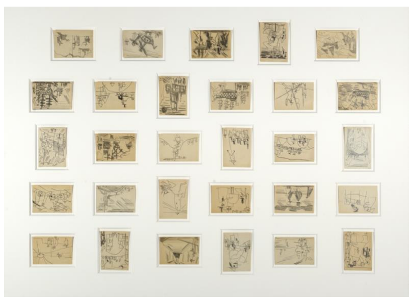
Lyonel Feininger (1871–1956) (Set of 29 Preparatory Drawings for Woodcuts), 1918/1919 Each drawing c. 2 13/16 x 3 7/8 in. (7 x 10 cm) Pencil on paper

Woodcut on Japanese laid paper Signed lower left: Lyonel Feininger Inscribed lower right: Das Tor